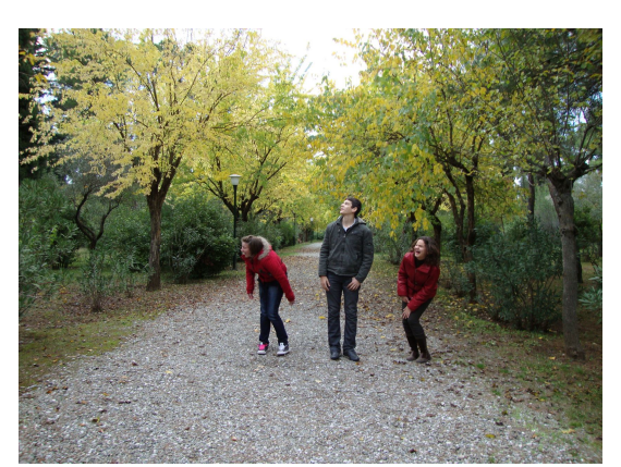
Later we went a walk in the wonderful park with its autumn colors and visited the source of the thermal water.